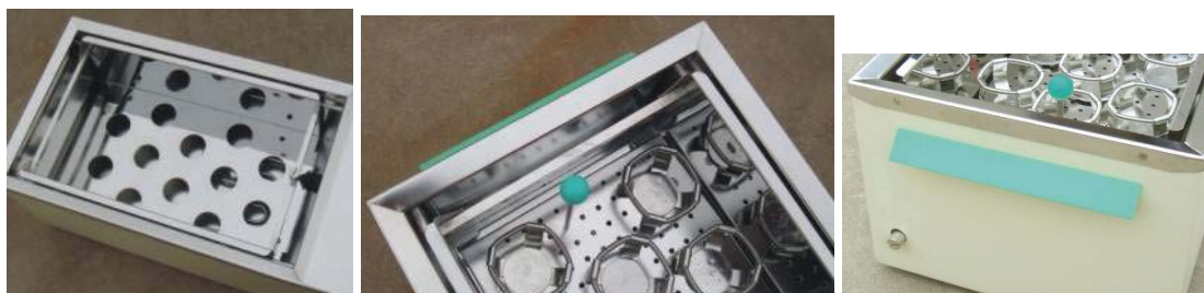
Mirror-finished Stainless Steel Bath Tank Interior

The latest ZHWY-110X Reciprocating Water Bath Shaker combines unmatched reliability and durability. It delivers superior temperature control and uniformity with a smooth shaking motion. Bath temperature is controlled to an accuracy of \pm 0.1^{\circ}\text{C} by a P.I.D microprocessor controller for optimum, reproducible bath conditions. Dual thermostats provide optimum protection for your work and water bath. The steeply gabled cover and inward-sloped tank rim allow condensate to drain neatly back into the bath, preventing condensate from dripping onto samples.